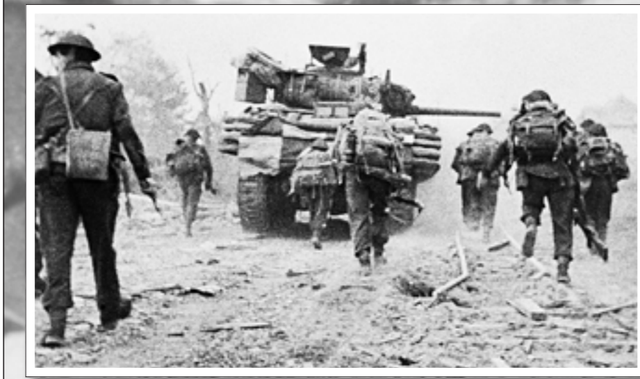
Royal Marines land at Juno Beach. Top, following a tank towards Ouistreham on D-Day and, right, commandoes on Sword Beach

At some point, they will gather with other Second World War veterans and their supporters at the British Normandy Memorial,