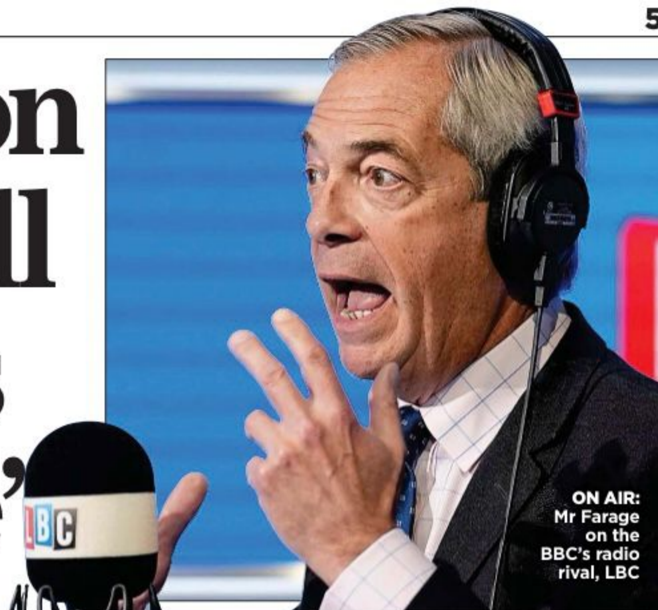
ON AIR: Mr Farage on the BBC's radio rival, LBC