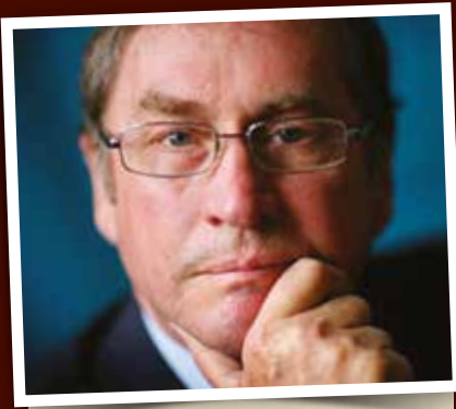
LORD ASHCROFT'S "HERO OF THE MONTH"