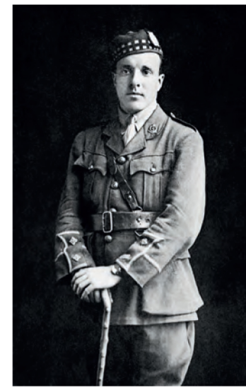
Captain Noel Chavasse VC and Bar, MC.

Perhaps the most astonishing story in the book is that of Captain Noel Chavasse VC and Bar, MC. Chavasse, a doctor serving with the Royal Army Medical Corps (RAMC), was the